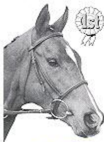
The Legacy (1979-2011)

“They Laughed When I Said I'd Make My Living Betting on the Horses...”