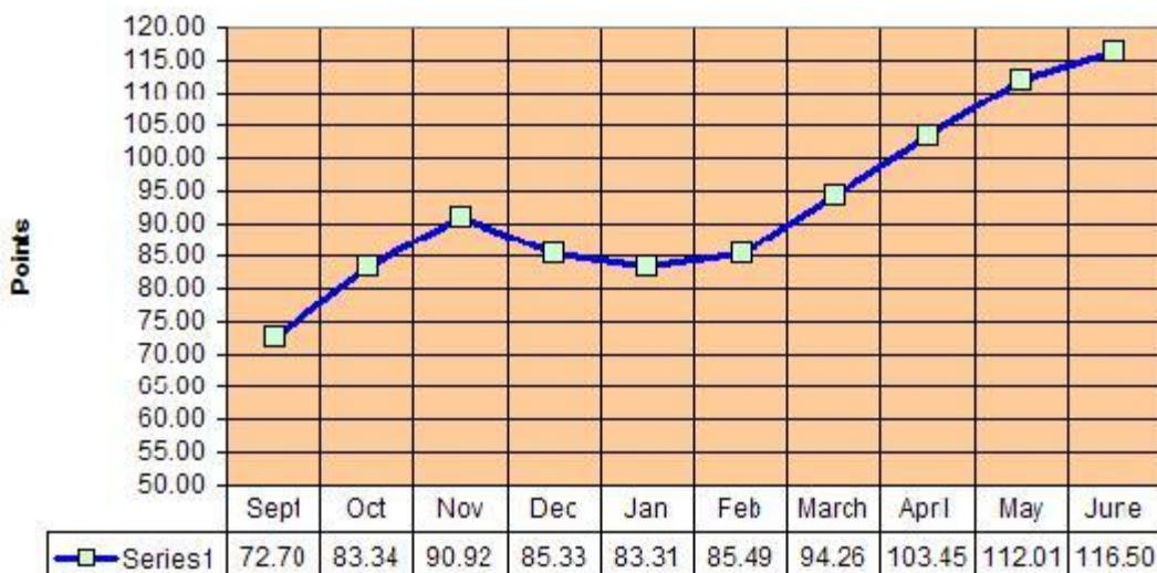
Champion Racing Lays Compounding