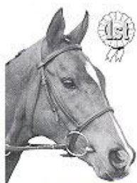
The Legacy (1979-2011)

“They Laughed When I Said I'd Make My Living Betting on the Horses...”